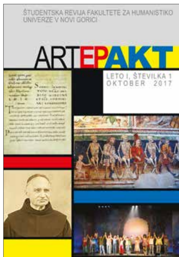
ARTEPAKT, magazine run by the students of the School of Humanities