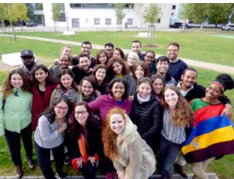
EMMIR students, Cohort 8